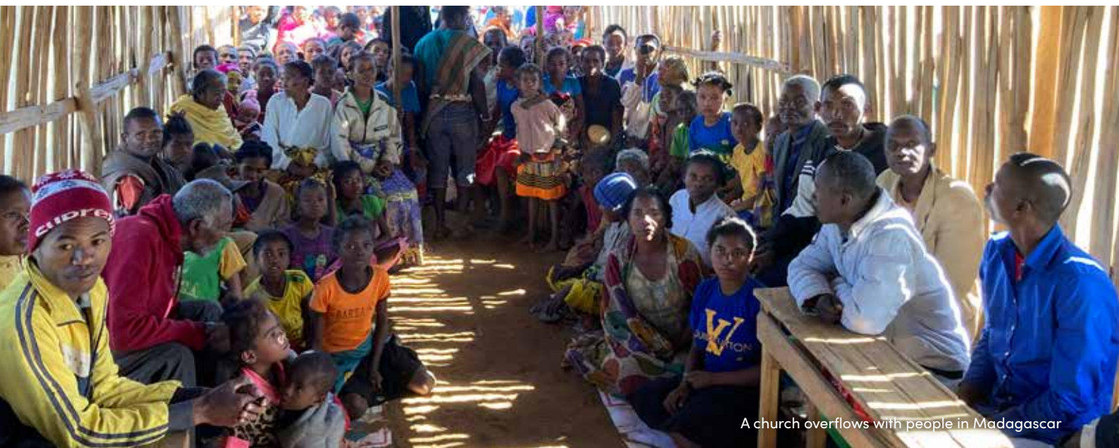
A church overflows with people in Madagascar

YOU CAN HELP TRAIN PASTORS AND EQUIP CHRISTIAN LEADERS IN DEVELOPING NATIONS.