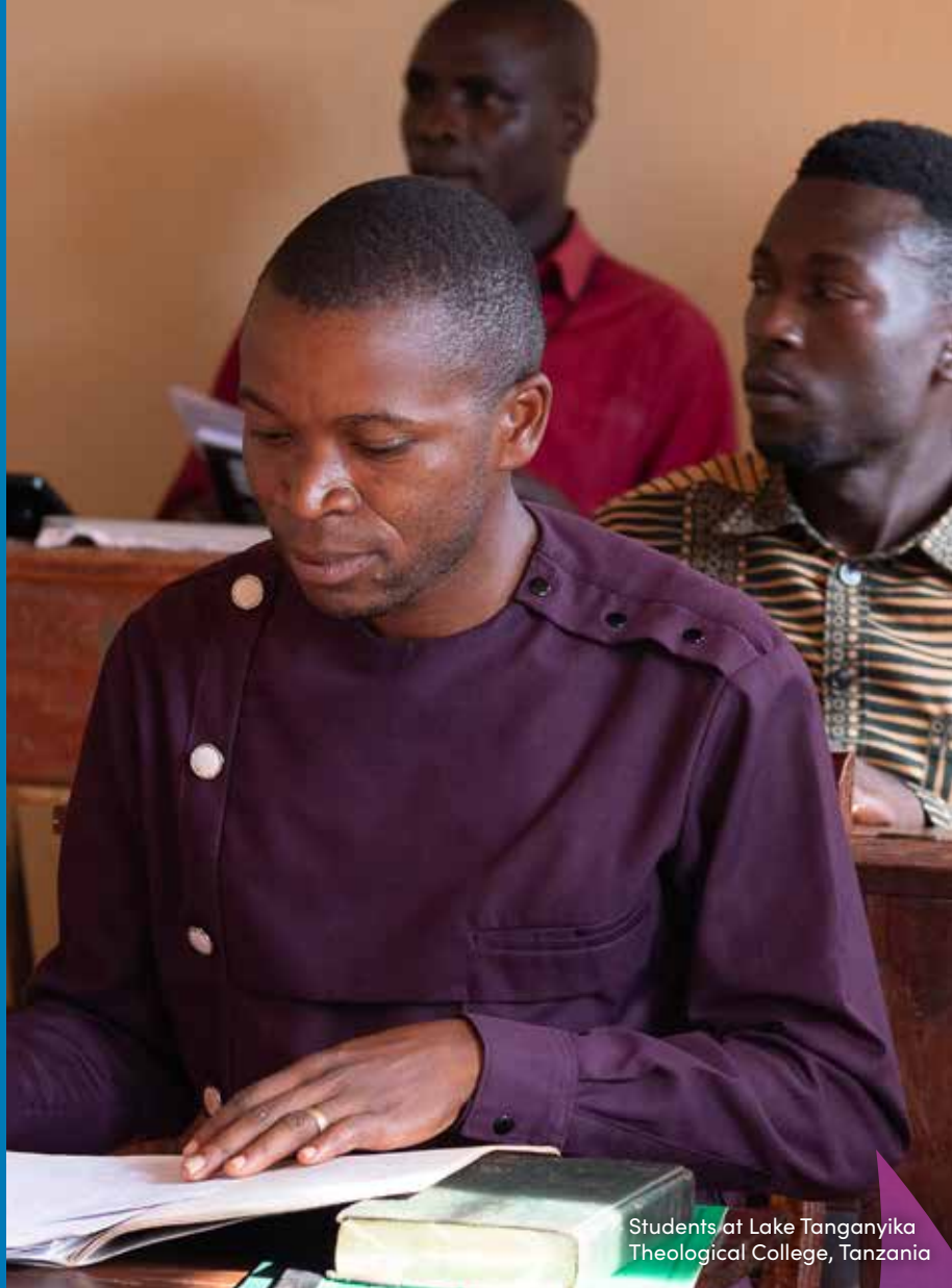
Students at Lake Tanganyika Theological College, Tanzania

Anglican Aid is helping to strengthen churches in some of the poorest areas around the world through training men and women for ministry and leadership.